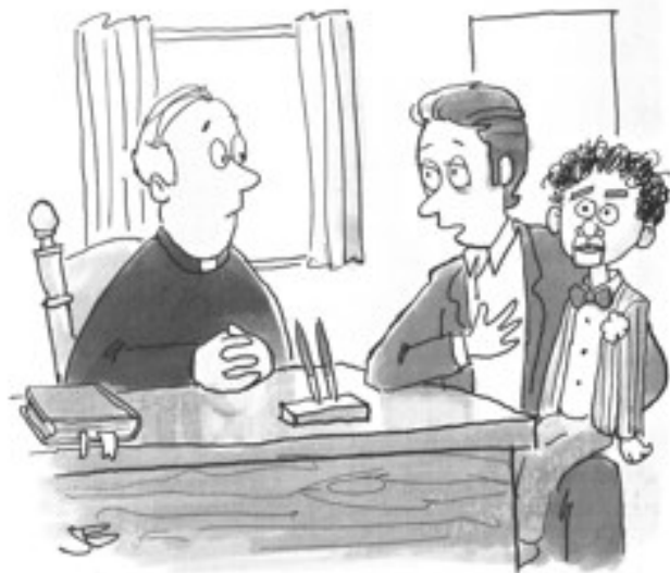
"Oh, we're not here to do MY Fifth Step..."